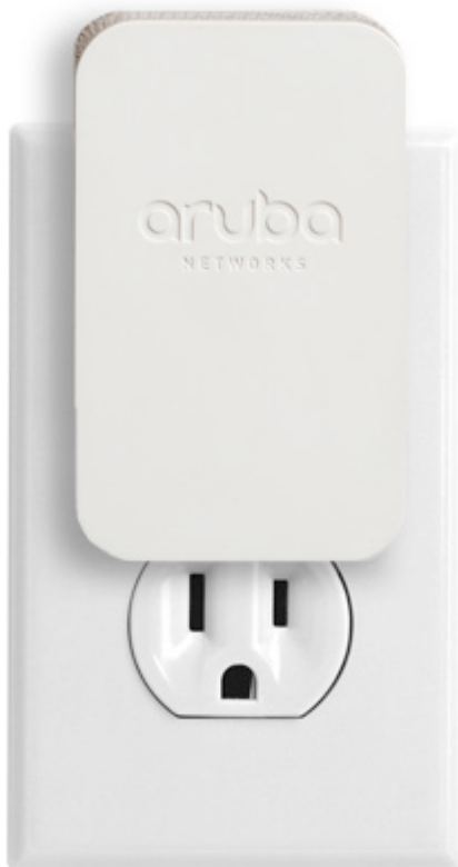
AS-100 wireless sensor

The Aruba Sensor is a small, dual-band 802.11n client radio and a BLE radio that can act as an additional Aruba Beacon to power mobile engagement applications without battery power. Aruba Sensor also allows all enterprises — whether they are Aruba Wi-Fi customers or not — to remotely manage their Aruba Beacon deployments over their existing Wi-Fi infrastructure.