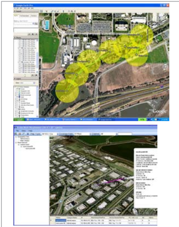
Detailed mesh visualization provides floorplans and maps with network topology overlay

The Aruba Secure Enterprise Mesh can support all enterprise wireless needs including Wi-Fi access, concurrent Wireless Intrusion Protection, wireless backhaul, LAN bridging, and point-to-multipoint connectivity, all with a single common infrastructure. Aruba's Quality of Service capabilities provide effective converged support for data, voice and video. Aruba's Secure Enterprise Mesh is an excellent solution for connectivity applications, including inter-building connectivity, outdoor campus mobility, wire-free offices, and wireline back-up; security applications, such as video and audio monitoring, alarms and duress signals, and industrial applications and sensor networks.