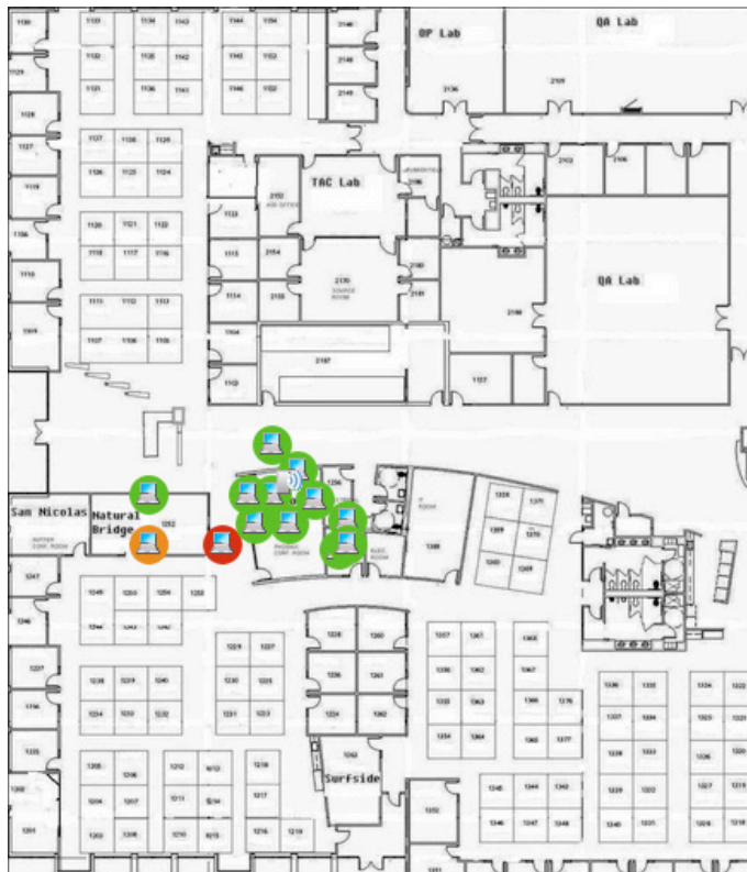
Figure 2: This floor plan shows an unhealthy client (red), which ClientMatch will automatically steer to a better AP and radio to optimize overall performance.

Likewise, if a user begins to roam, ClientMatch will move that client to another AP to maintain optimal performance. ClientMatch focuses on optimizing the lowest performing clients; for example, only unhealthy clients are moved, such as a user experiencing interruptions on a call due to dropped packets.