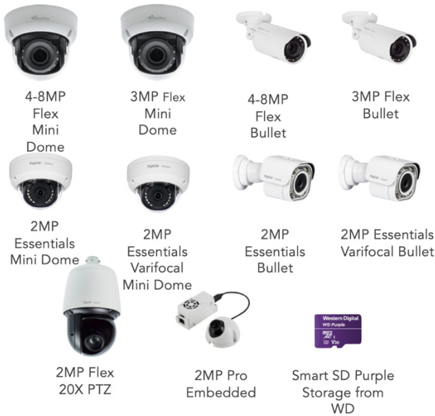
Cloudvue Camera Portfolio