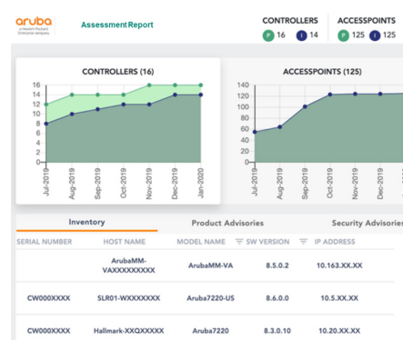
Figure 1. Sample assessment report

Our Network Health Check provides you with the information and expert guidance you need to focus your actions where they matter most. Use the health check report findings to identify weak points and to focus your IT team on best practice recommendations for your next-step actions. Discuss your report findings with HPE Aruba Networking product experts who can point your team in the right direction with less effort.